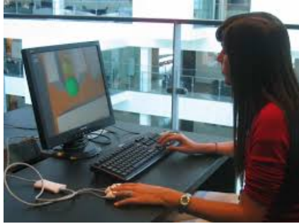
(a) The IOM device used during the data collection experiment reported in [108].