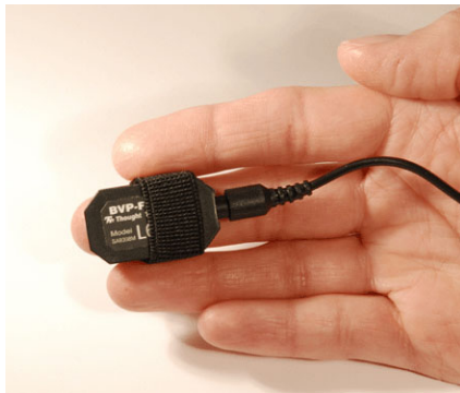
(c) The blood volume pulse sensor of the Pro-Comp Infiniti device