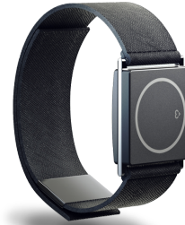
(b) Empatica's Embrace wristband